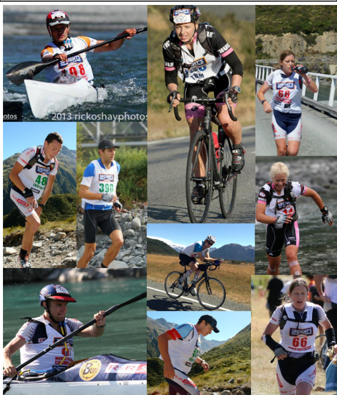
Some of the EPC athletes in action at the 2013 Speight's Coast to Coast. Well done to everyone who competed

Well the biggest multisport race of the year is done and dusted and the EPC team was out in force producing some great performances. Now the focus turns to adventure racing with GODZone just around the corner, along with the road cycling nationals, track cycling age group nationals and some of the bigger MTB races on the horizon. We hope everyone is getting out enjoying the sunshine and putting in the hard yards.